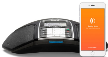
KONFTEL 300IPx Optional connection: USB

Cisco is one of the leading providers of Unified Communications and Collaboration (UCC), cloud services and other applications. Konftel's strategy is to optimize and certify our products for the leading communications platforms on the market.