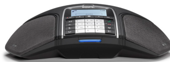
KONFTEL 300Wx Optional connections: USB, Smartphone