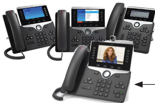
Cisco IP Phone 7800 Series Cisco IP Phone 8800 Series (optional deskphone adapter)